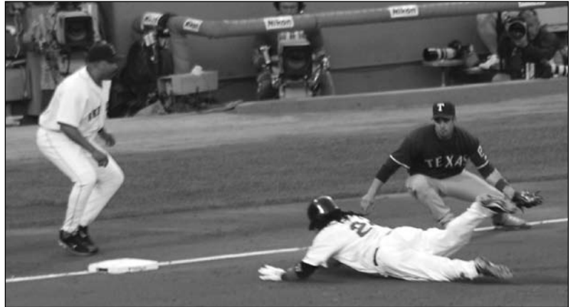
Manny Ramirez slides into 3rd base during the Red Sox win over the Texas Rangers