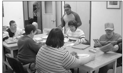
Individuals from Employment Services hard at work at The Price Center

Recently Employment Services has begun new ventures. Job seekers found employment at PETCO. One is working to clean and organize products throughout the store. She was recently approved for The Ride, the T's Paratransit program, and is completely independent with her new part-time job. Our newest PETCO employee is responsible for stocking the shelves with dog and cat food. He travels to and from work independently. We have greatly enjoyed building our relationship with PETCO.