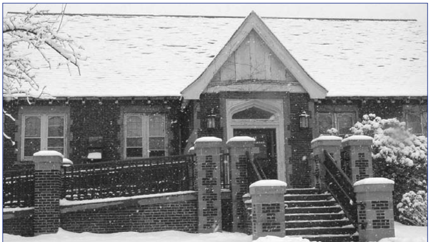
25 Chestnut Street was an early home for The Price Center, now is the current location for the Newton Police Annex