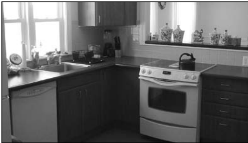
1751 Washington Street New Kitchen

The residence at 1751 Washington Street provides a warm comfortable home to four men who have significant physical challenges. The original house was a spacious ranch that was constructed in the early 1950's. Working with a local architect, The Price Center was able to hire Construction By Design to implement the architect's concepts to open the floor plan to allow for easier movement through the house and increase its open accessibility.